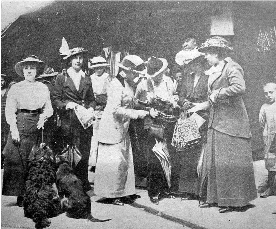
Fig. 3: Publicity photograph. I Miti tis Athinas/Athena's Nose (Emile Lester, 1914).

The programme of the evening was always a varied one, featuring – besides the tableaux vivants – pieces of theatre, music, dance, literature and cinema. Performances of one-act plays (frequently in the original French language), poem recitations, music concerts, singing of western, Greek folk or folk-like songs and dance performances in ancient Greek or folk/traditional costumes were regular on the programme. Parades in national dress (Appendix: PERF. No 11), talent shows (Appendix: PERF. No 10) or films were the exception.