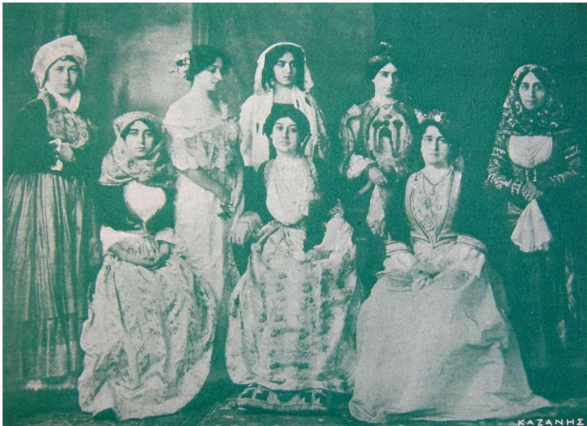
Fig. 10: Tableau Vivant: Queen Amalia’s court. Lyceum Club of Greek Women. New Year’s celebration, Municipal Theatre, 6.1.1912.

Unlike ancient Greek civilisation, which had always been considered a keystone of modern Greek civilisation, Eastern Roman Empire was not included in the national narrative until the late 19th century (Liakos 1994: 179-183). The amateur tableaux vivants performers were mainly interested in portraying – with the exception of a Byzantine Madonna (Appendix: PERF. No 7) – members of the Byzantine royal court: Empress Theodora’s Procession with Retinue ( Fig. 4 ) (Appendix: PERF. No 1), Crown of the Byzantine Emperor Constantine IX Monomachos (Appendix: PERF. No 5) and a Byzantine procession of Sant’Apollinare Nuovo, Ravenna (Appendix: PERF. No 8). The choice was made because these themes offered not only an opportunity for rich spectacle, but also a means of establishing royalty as a national institution, “that is, an institution which could claim origins in the national past” (Fournaraki 2010a: 2074). Furthermore, the country’s wish to see the Byzantine Empire restored on the aftermath of the Balkan Wars was adequately illustrated in these tableaux vivants (Fournaraki 2010b: 386).