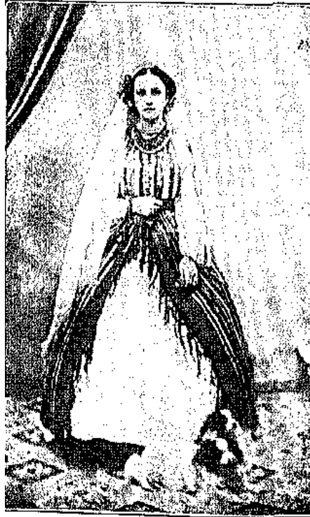
Fig. 1: Greek tableaux vivants, Royal Palace, 1858-1859.